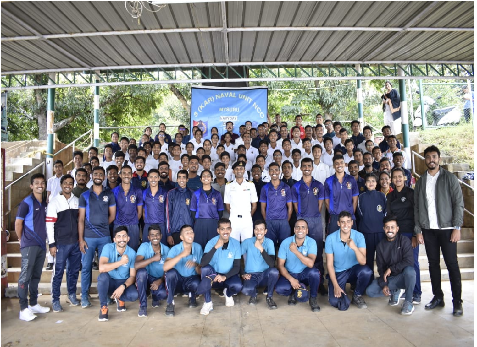
Yuvaraja's college Mysore cadets won 1 st place in BOAT PULLING COMPETITION which was held on Dec 4 th 2022.